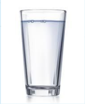
Glass of water